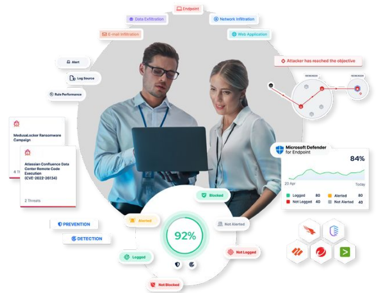
With The Picus Platform, gauge your threat-readiness at any moment and take swift action to strengthen resilience